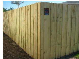
Board on Board