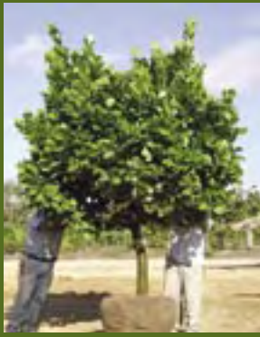
Small Leaf Pitch Apple Clusia guttifera